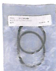
BIG BLUE FILTER HOUSING O-RING SO - FHS - BB