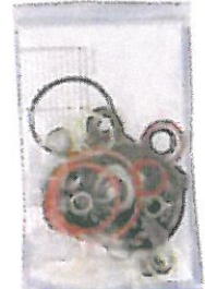
SPECTRA SEAL & O-RING KIT 7% & 10% KIT - HP - S&O