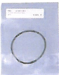
STANDARD FILTER HOUSING SEAL SO - FHS - LP10