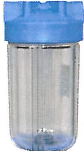
10 3/4" BIG BLUE FILTER HOUSING FT - FTH - 10BB