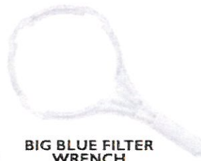
BIG BLUE FILTER WRENCH FT - FHW - BB