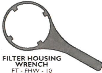
FILTER HOUSING WRENCH FT - FHW - 10