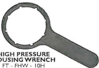
HIGH PRESSURE HOUSING WRENCH FT - FHW - 10H