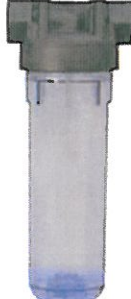
LOW PRESSURE FILTER HOUSING FT - FTH - 10L