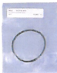
LOW & HIGH PRESSURE FILTER HOUSING O-RING SO - FHS - 10H