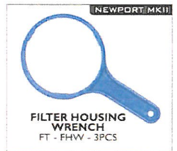
NEWPORT MKII FILTER HOUSING WRENCH FT - FHW - 3PCS