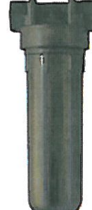
HIGH PRESSURE FILTER HOUSING FT - FTH - 10H